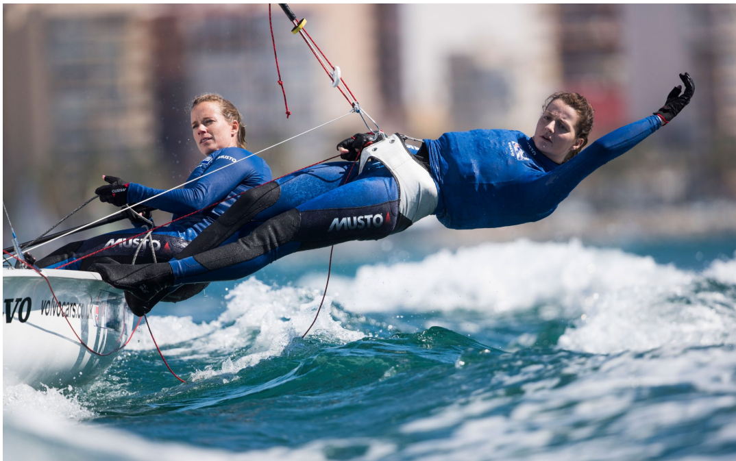
Eilidh MacIntyre MBE, Olympic gold medalist and our guest for the fireside chat on Monday 1st August

Meeting ID is 288 830 5105 Password is Shipmate