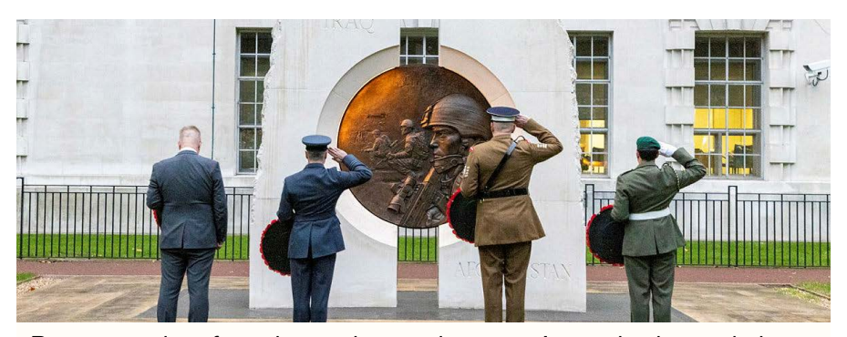
Representatives from the services and veterans' organisations saluting before laying wreaths at the Iraq and Afghanistan Memorial, Victoria Embankment Gardens, London, on 7th October 2021.