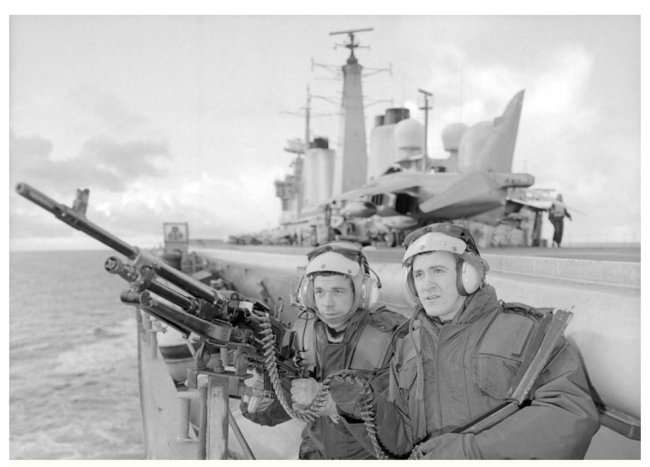
14th June 2022 marked the 40th anniversary of the ending of The Falklands War. Pictured: HMS Invincible's gun crew.