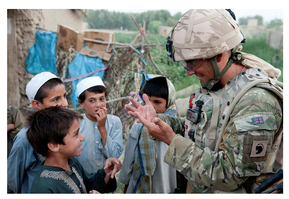
A soldier from the Queen's Royal Lancers, 2nd Troop jokes with local children, whilst operating in the area of Patrol Base Bolan, Afghanistan, in June 2010.