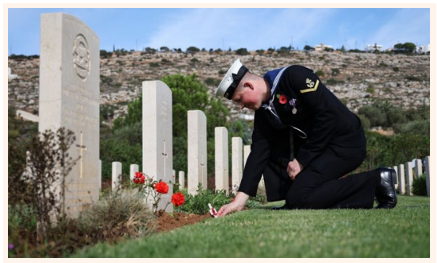
A member of the ship's company of Type 45 destroyer HMS Duncan pays his respects at the Remembrance Day ceremony at the British and Commonwealth War Graves site in Souda, Crete. HMS Duncan is currently working with NATO's SNMG2 Task Group. See December's Semaphore Circular for more pictures from Remembrance ceremonies.

SCAM ALERT Next Friday (November 24) is Black Friday – an American concept that has taken root in the UK over the past few years. It first gained wide usage in the US in the 1980s; at first it reflected the crowds that flocked to start their Christmas shopping straight after Thanksgiving, causing chaos on roads and in city centres, and another definition refers to the fact that at that point retailers moved into profit - from the red to the black.